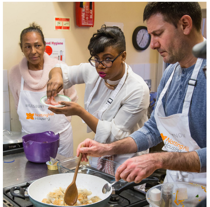
Health eating course