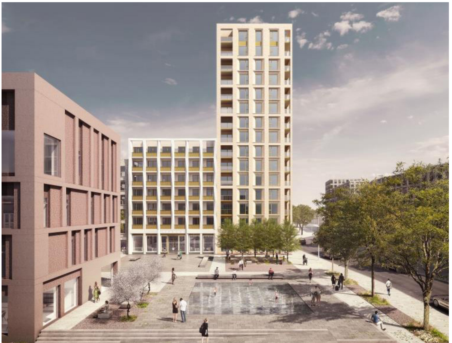
Artists impression of Plot 18

By relocating the existing facility we will be able to free up more land on the first development site to bring forward more new homes as part of this first phase.