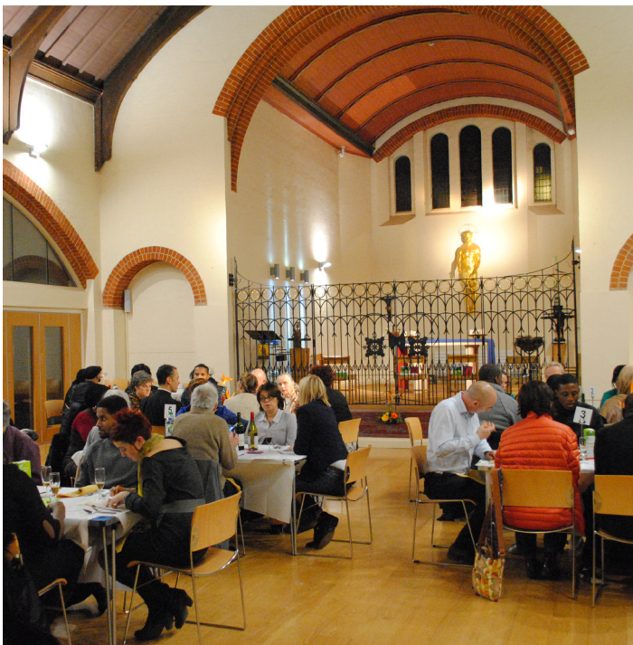
Dinner and debate

Last year more than 2,702 local people attended various resident involvement and engagement activities including design consultation, community events and smaller special interest forums.