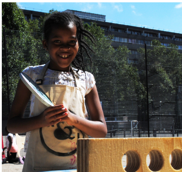
Assemble & Join