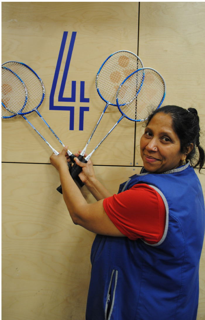
Happy Badders community grants recipient

Projects that we have funded include Silverfit, a fitness club for older residents, intergenerational arts workshops and a youth-led project to improve a local MUGA, benefitting some 806 residents.